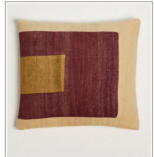
Eggplant is a color so well suited for this weave, especially when paired with yellow and cream.