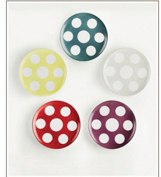
Set against a solid, colorful ground, oversized dots adorn the surface of the Bonjuk dinner plates.