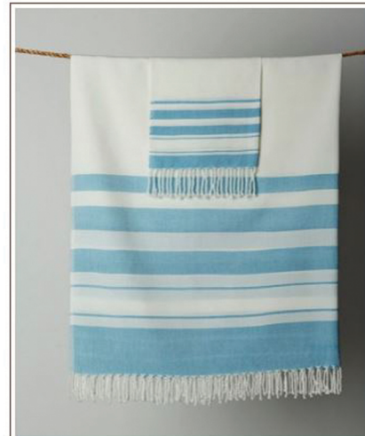
Organic 100% cotton Hand-Woven Peshtamal Yazlik Towels with soft alternating stripes and long fringe. They get even softer with washing.